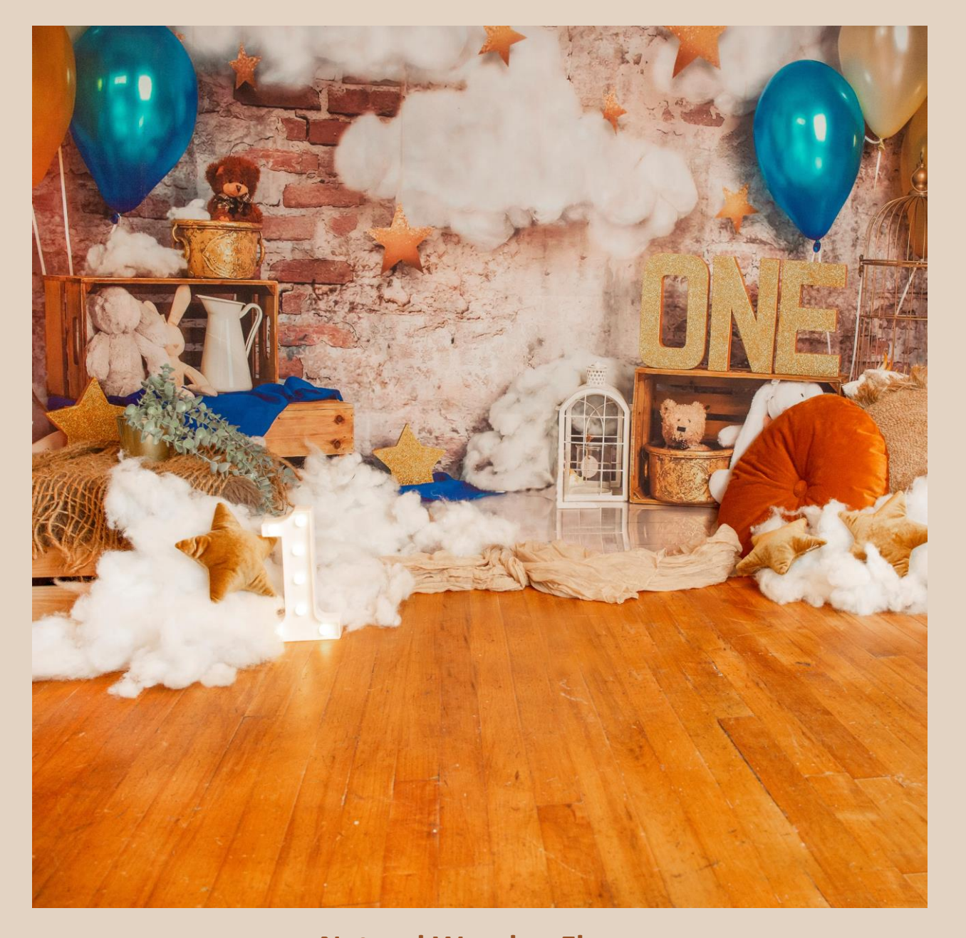
Natural Wooden Floor