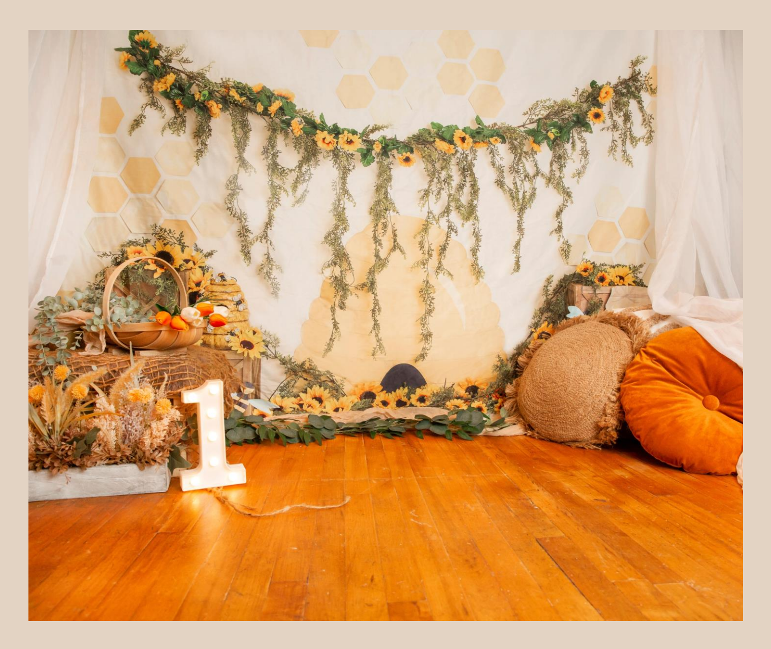
Natural Wooden Floor