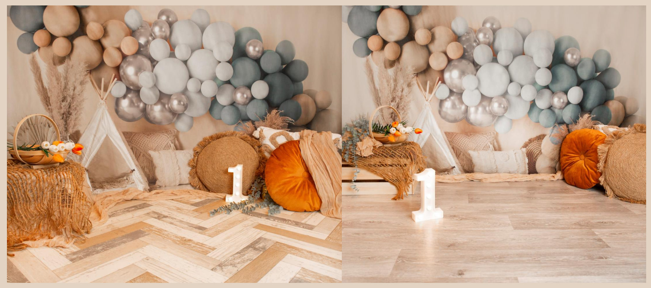
Zig-zag wooden floor drop