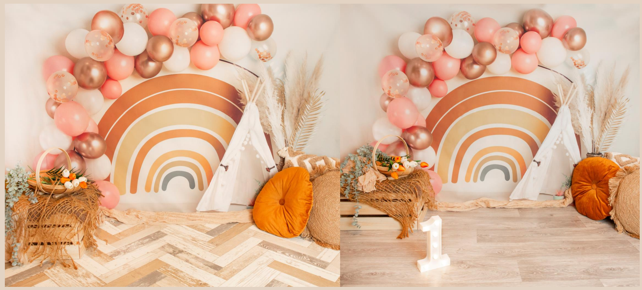
Zig-zag wooden floor drop