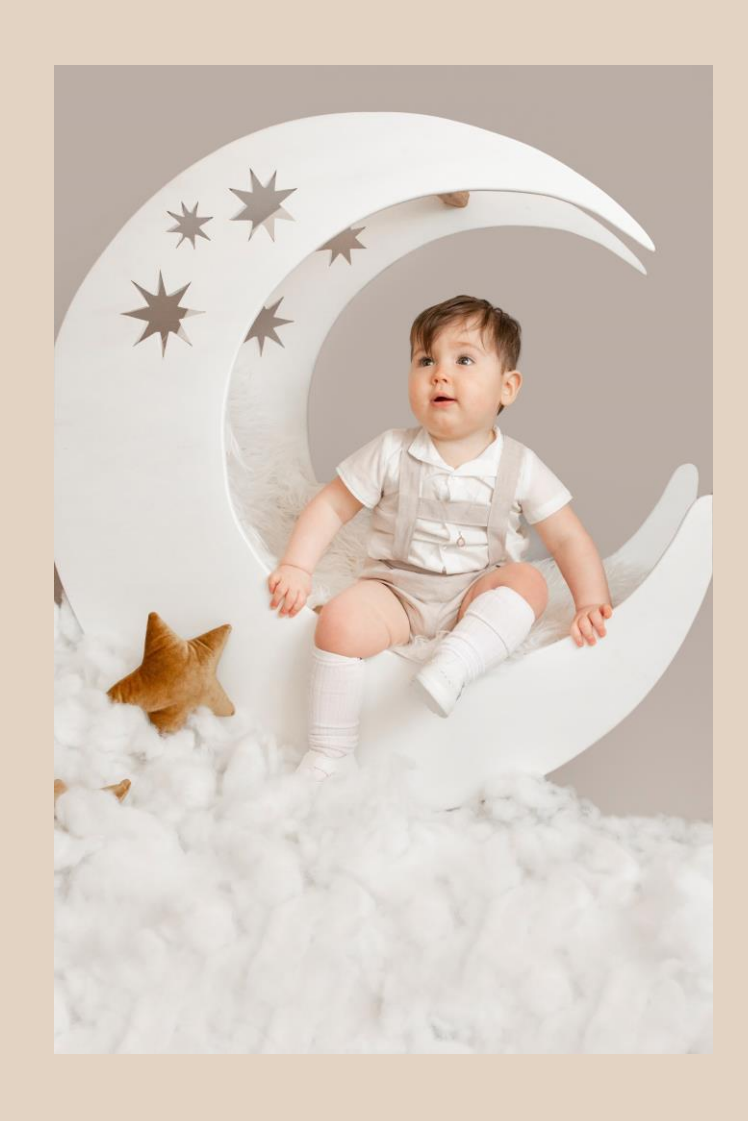
Choice of white or Grey backdrop