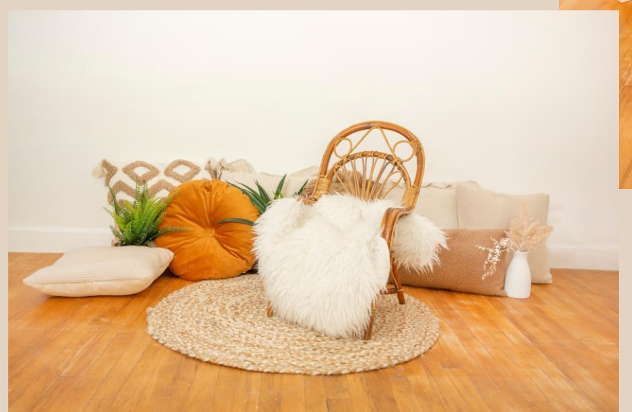
This setup can be adjusted for all ages